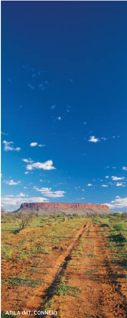
ATILA (MT. CONNER)