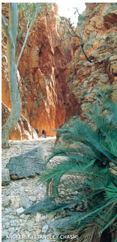
ANKERLE (STANDLEY CHASM)