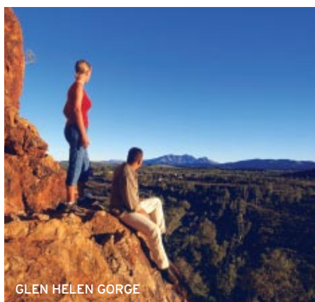
GLEN HELEN GORGE